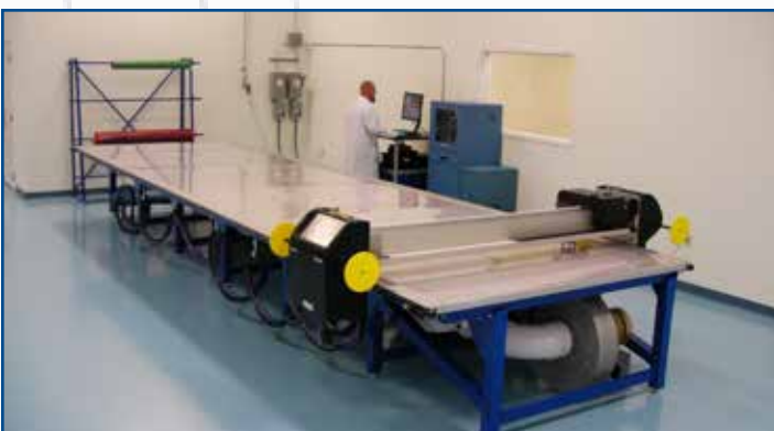
Computerized Cutting Table