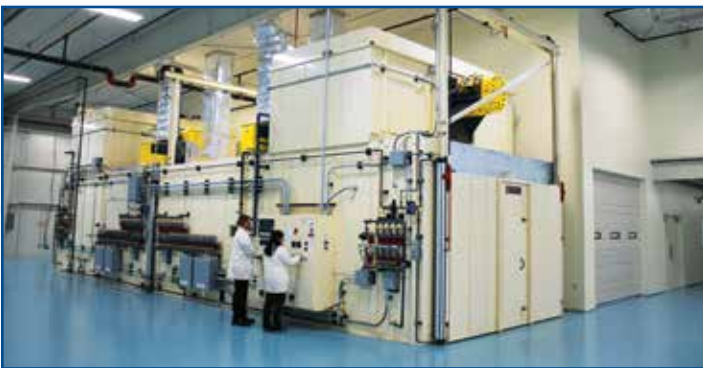
12 Ft. by 8 Ft. by 45 Ft. Dual-Zone Oven