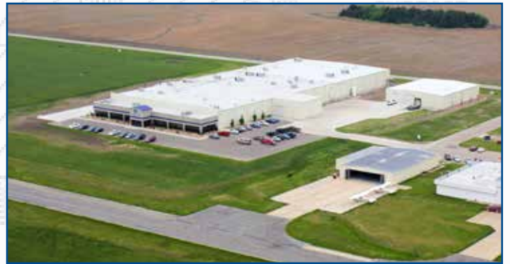
Park Aerospace Technologies Corp. in Newton, Kansas

Park Aerospace Technologies Corp. (“PATC”) is Park’s new advanced composite prepreg and parts manufacturing and design facility located in Newton, Kansas. The PATC facility contains approximately 90,000 square feet of composite materials and parts manufacturing and laboratory space and is equipped for prototype development to production. The facility has a 7,500 square foot clean room outfitted with computerized ply-cutting and laser projection ply-locating systems. A separate area, complete with a 5-axis router, is dedicated to core cutting and preparation. The facility’s curing capabilities range up to 850°F