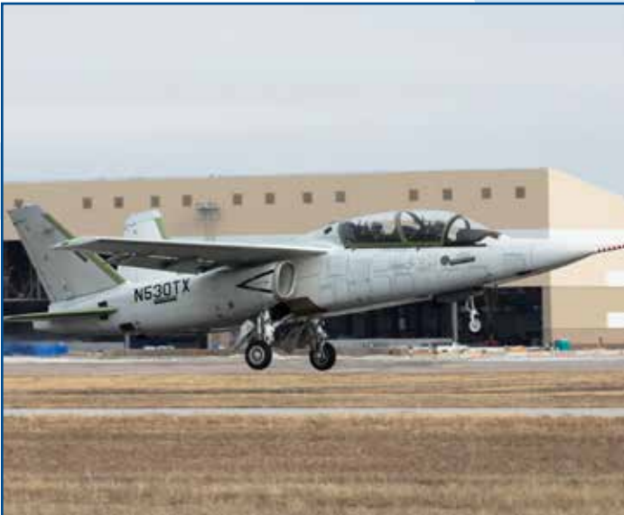
First Production Conforming Scorpion Jet taking off for its Maiden Flight on December 22, 2016