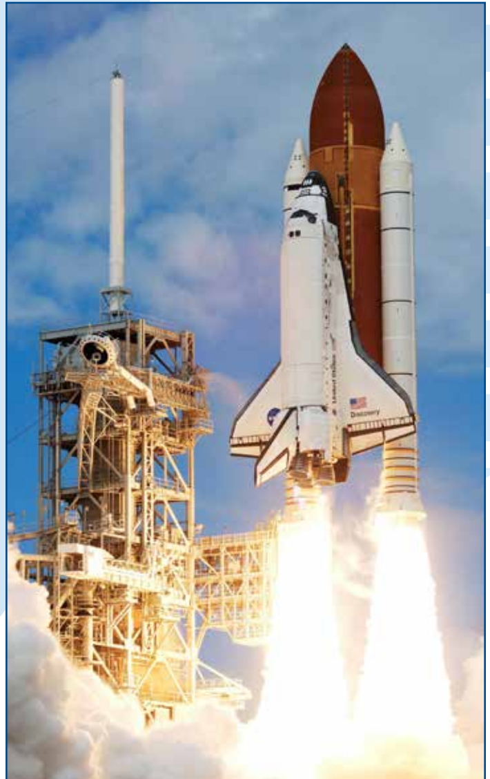
Park's SIGMA STRUTS™ were chosen for NASA's Space Shuttle