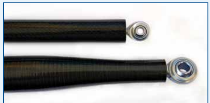
ALPHA STRUT™ and SIGMA STRUT™

cations. The SIGMA STRUT is designed for space and other aerospace very high load bearing applications.