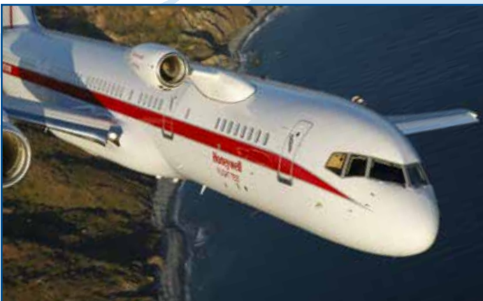
New Business Jet Turbopan Mounted on Testbed Fairing Built by Park