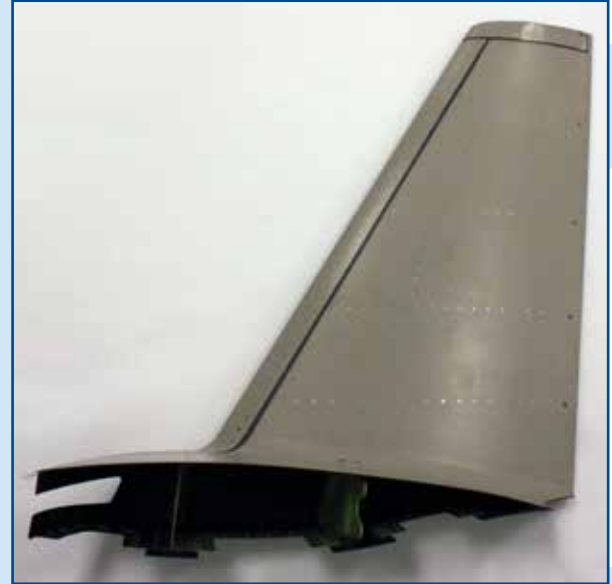
Winglet for New Business Jet