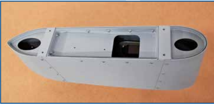
UAV Weapons Pylon

The final step in the product build is the assembly of parts and hardware into a final component or subassembly. It has become more common for customers to require finished assemblies. To meet those requirements, Park has dedicated a section of the PATC facility to final assembly. Final Assembly capabilities include bonding, close tolerance/precision drilling, riveting, sealing and final inspection before release to the customer.